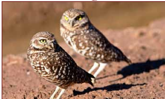
Burrowing Owls.

The U.S Fish and Wildlife Service, on September 9, announced a grant of $2,000,000 under the Endangered Species Act to East Contra Costa County Habitat Conservation Plan/Natural Community Conservation Plan (HCP/NCCP). These funds will purchase approximately 700 acres of important habitat