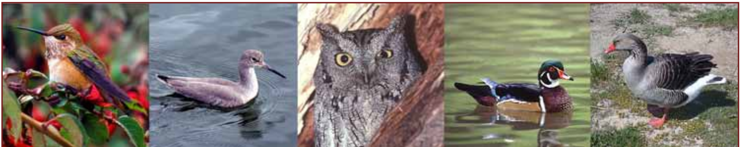
Five more birds of 314 species at risk from global warming: Allen's Hummingbird, Willet, Western Screech Owl, Wood Duck, Greater White-fronted Goose.