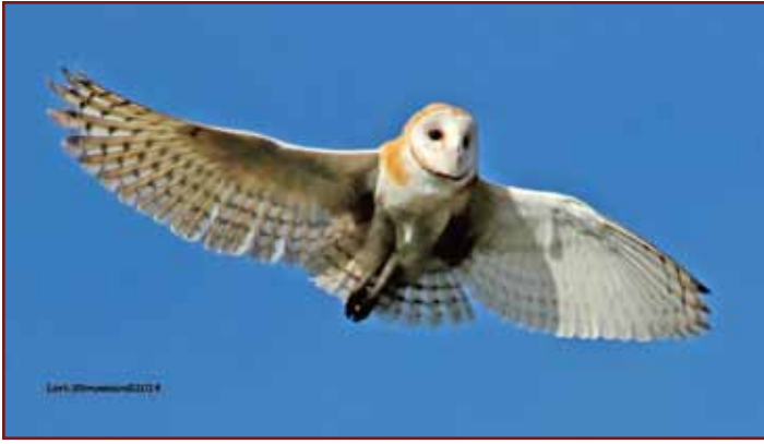
Barn Owl, Point Reyes, September 27.

Antioch Dunes, September 13. No report was submitted for this trip, but participants would have had the opportunity to view a new 18-foot wide kiosk at the entrance to the refuge that explains the restorations under way for the benefit of the federally endangered Lange's metalmark butterfly, Contra Costa wallflower and Antioch Dunes evening primrose that Antioch Dunes NWR was created to protect. The project is a cooperative inter-agency effort to reuse sand dredged from the nearby San Joaquin River for restoration of depleted sand dunes at the site. Now, thanks to coordination among the Port of Stockton—which donated the kiosk—the Army Corp of Engineers and the Fish & Wildlife Service, critical refuge habitat will be revived.