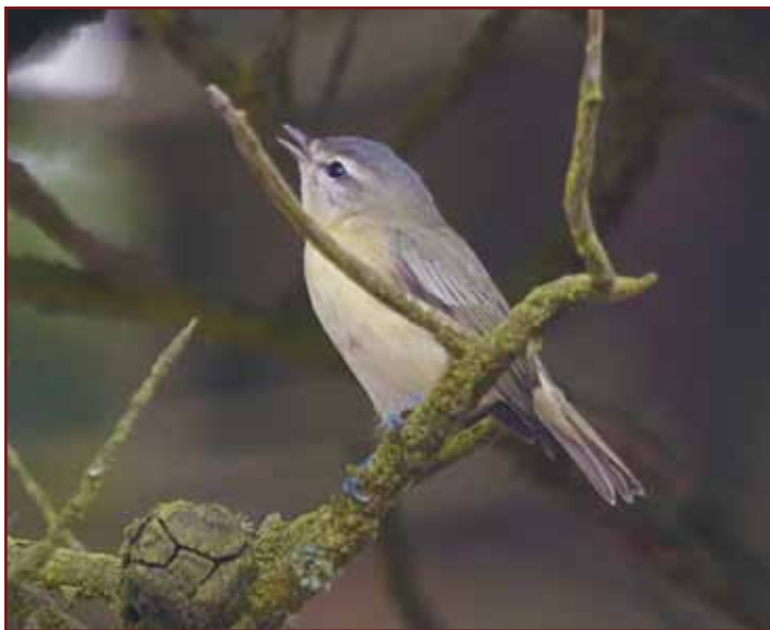
Philadelphia Vireo.

Outer Point Reyes, September 27. MDAS annual fall trip to Outer Point Reyes dawned with blue skies and temperatures forecast for the 60s. After the obligatory fortification stop at the Point Reyes Station Bovine Bakery, participants gathered at the Point Reyes Visitor Center before heading out to the Mendoza Ranch (Historic Ranch B) to begin the day's activities. Earlier in the week on a scouting visit, a Philadelphia Vireo had been found and it was hoped it would be encountered again—however this was not to be. Several Great Horned Owls and Barn Owls together with Western Bluebirds nevertheless were observed in the trees overlooking the pond. Again following postings of others earlier in the week as well as results of our own scouting trip, we next headed to the Fish Docks to see what migrants/vagrants might still be around. The pine trees past the park residence on the way to the lifeboat station proved quite birdy—notable finds were Nashville,