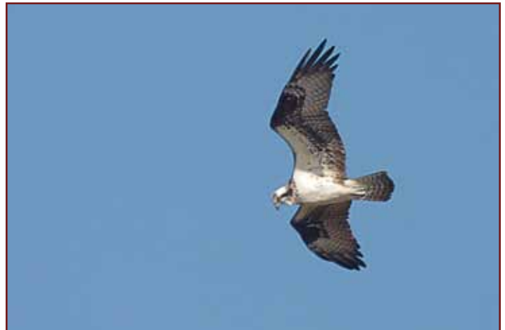
Osprey over Limantour.

Carpool leaves at 7:00 AM from El Nido Ranch Road. Meet at 8:30 AM at the Bear Valley Visitor Center, Point Reyes National Seashore. Take SR 24 to Oakland, then I-580W to Richmond and the San Rafael Bridge (toll). From US 101N, take Central San Rafael exit. Go 2 blocks, turn left on 3rd Street and continue west to Sir Francis Drake Blvd. Turn right on Sir Francis Drake. At SR 1 at Olema, turn right for 0.25 miles, then turn left on Bear Valley Road. Visitor Center is off Bear Valley. This trip includes forest birds on the ridge and ducks, shorebirds and often loons and grebes on the bay. Bring lunch and a beverage.