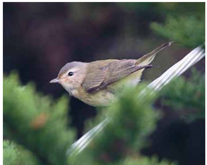
Warbling Vireo.

Philadelphia Vireos have the most northerly summer range of all vireos. They breed across much of Canada, from eastern British Columbia to the St. Lawrence River basin. They winter in Central America. During spring and fall migration, they occur widely throughout the United States. They migrate at night, and so are only rarely seen in Philadelphia. John Cassin, who described and named this bird in 1851 noted, "I shot the bird now described in Bingham's Woods near Philadelphia in September, 1842, but have never seen another specimen."