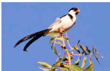
Pin-tailed Whydah.

The past month has seen the return of many of our wintering birds. White-crowned, Golden-crowned , Fox and Lincoln Sparrows ; Hermit and Varied Thrushes , Ruby-crowned Kinglets , and Yellow-rumped Warblers . Wintering ducks and geese are slow to return. A big surprise is the return of the Tropical Kingbird (maybe the same one) to Heather Farm Pond Area.