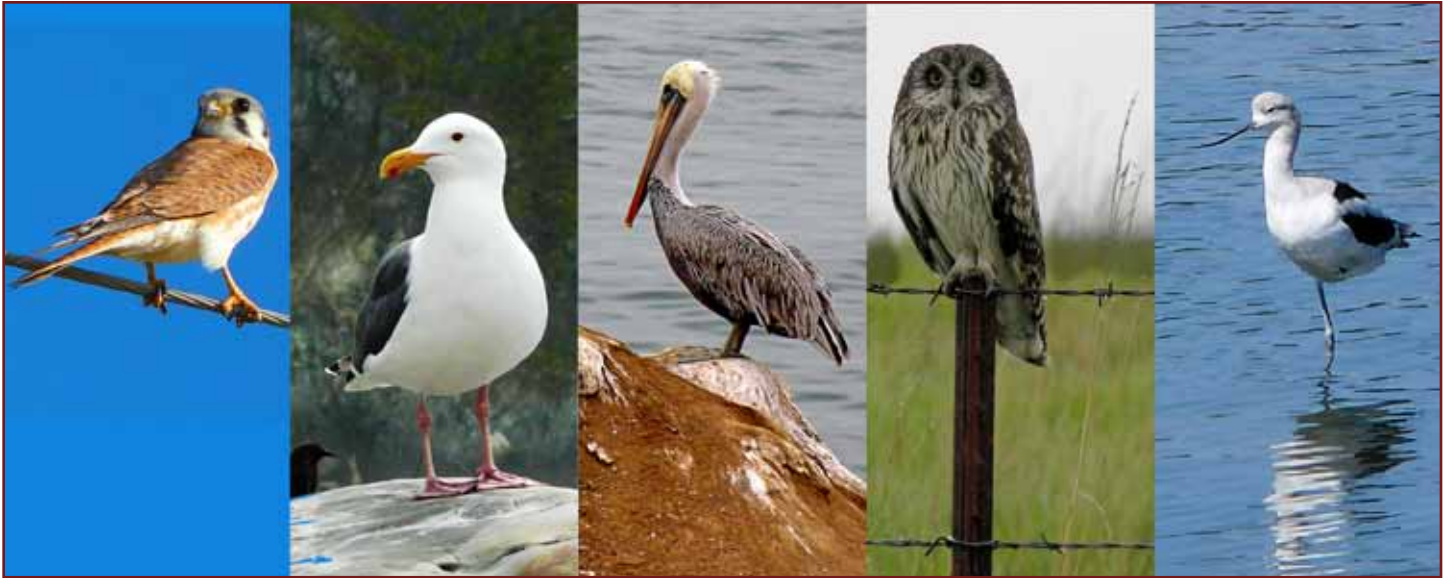
Five birds of 314 species at risk from global warming: American Kestrel, Western Gull, Brown Pelican, Short-eared Owl, American Avocet.

Half of the bird species in the continental U.S. and Canada are threatened by global warming. Many of these species could go extinct without decisive action to protect their habitats and reduce the severity of global warming. That's the startling conclusion reached by Audubon scientists in a new study.