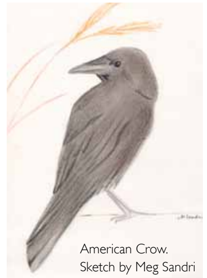
American Crow. Sketch by Meg Sandri