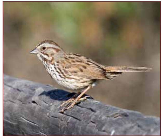
Heermann's Song Sparrow ( Melospiza melodia heermanni ) Mission Trails Park, San Diego, California.

The Bay Area species are the Alameda Song Sparrow ( M. m. pusillula ), in the South Bay, Samuel's Song Sparrow ( M. m. samuelis ) in the North Bay, and Suisun Song Sparrow ( M. m. maxillaris ) in Suisun Bay from the Carquinez Strait east