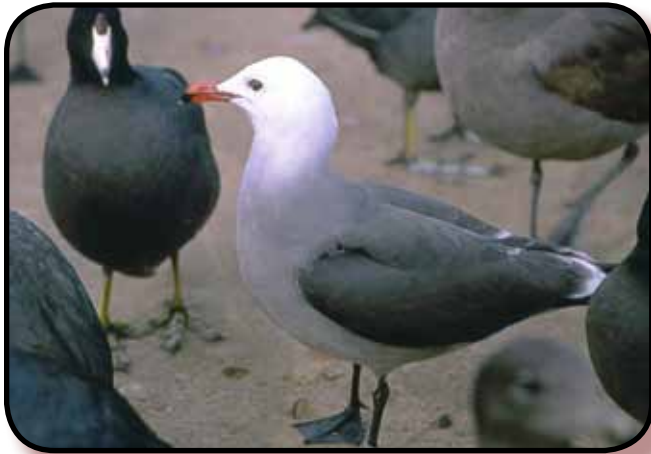
Heermann's Gull...Ellis Myers photo.

Non-Profit Org. U.S. Postage PAID Permit No. 66 Concord, CA