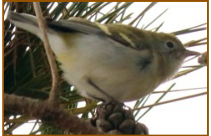
Chestnut-sided Warbler

Wednesday, so four of us drove to Outer Point Reyes hoping for some good birds. The birds we expected to see were a Yellow-green Vireo, an American Redstart, a Pectoral Sandpiper, and a Red-throated Pipit. The weather was cold, it was windy, and we saw none of those birds. But we met some others near the lighthouse who were also looking, so we were not alone. We did see a Willow Flycatcher in the vireo location, and in the trees beyond the Fish Docks residence, we were told to look for a Chestnut-sided Warbler. We finally found it and then retreated to the car for lunch. We stopped at the Mendoza Ranch and were skunked, then took a walk at Drake's Beach and found no