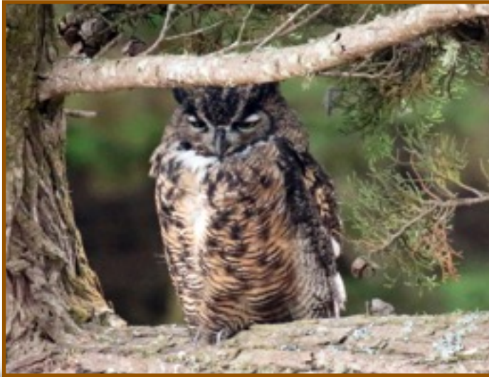
Great-horned Owl

Non-Profit Org. U.S. Postage PAID Permit No. 66 Concord, CA