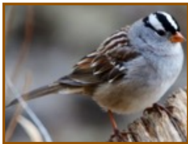
White-crowned Sparrow

We truly are all connected to each other by the birds that we often think of as "ours." The same sparrows, beloved in backyards and at bird feeders in the Lower 48 during winter, are also loved and named by local people in the long Arctic summer days. The next time you see a White-crowned Sparrow, think