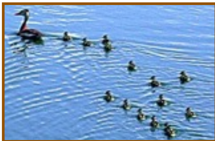
Black-bellied Whistling-Ducks on McAllen, Texas Sewage Ponds on the Texas Coast Birding Trail, Ellis Myers photo

And, that's good news for Black-bellied Whistling-Ducks, other waterfowl, wildlife, birding enthusiasts, and nature lovers. ~Ellis Myers