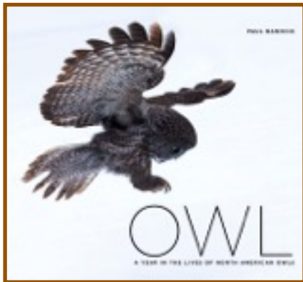
Above: Owl book cover; above R: Burrowing Owl family