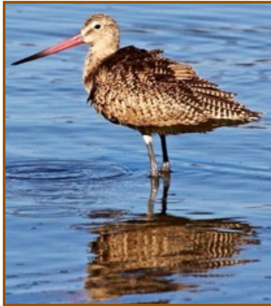
Marbled Godwit

colored lining. Winter birds and juveniles are paler, with less barring below. The long, upturned bill has a pink base and a dark tip. The male's bill is a bit brighter than the female's bill, while the females are slightly larger and longer-billed than males.