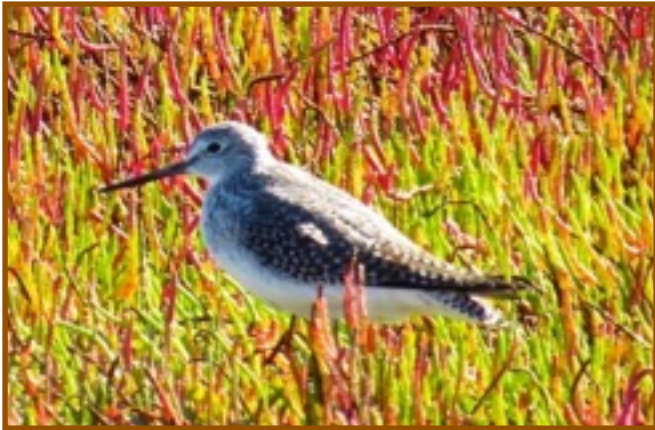
Greater Yellowlegs in the pickleweed