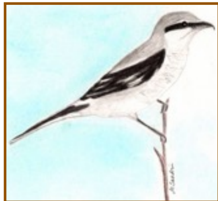
Northern Shrike, Megan Sandri sketch

As a birder who works for Audubon, I immediately keyed into the birds in the area. Young White-crowned Sparrows with brown heads tumbled around the low tundra brush. Boreal Chickadees bubbled among the short spruce trees. A Pacific Loon called hauntingly in the feeble twilight that persists through the Arctic summer nights. Early one morning I ventured out to find some early birds. It turned out, the mosquitoes are also early risers in the Arctic. I felt a bite on my hand, but resisted lowering my binoculars. I had