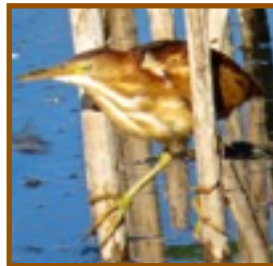
Least Bittern

Meet at 9 AM at the Mt. View Sanitary Visitor Center. Exit from I-680 southbound at Arthur Road, turn left and go under the freeway or Exit I-680 northbound at Pacheco Blvd., turn right on Arthur Road, and go under the freeway. At 0.4 mile turn left onto MVSD private road, through the gate, alongside the freeway and through the tunnel under I-680. Park and sign in at the Visitor Center. Trails may be muddy. Close-up looks at dabbling ducks, possibly bitterns, and herons. After walking the ponds we'll drive back to the viewing platform to observe more birds and complete the bird checklist. If you wish, bring a lunch and beverage, and explore the Martinez shoreline later on your own.