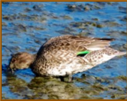
A Green-winged Teal forages on the mudflats of the Bay

Our MDAS chapter has over 400 household memberships full of wonderful people with diverse skill sets, interests, and expertise. Please consider volunteering your time and talents for one of the MDAS Board positions posted below.