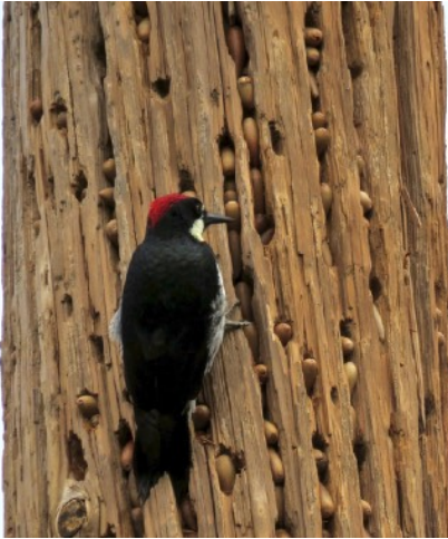
An Acorn Woodpecker checks the pantry.

Non-Profit Org. U.S. Postage PAID Permit No. 66 Concord, CA