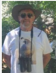
The Bird Wide Web

Imagine being able to point a cell phone at a singing bird and have an app immediately identify it. Maybe even tell you if it's male or female. And have it ignore familiar birds nearby, the chatter of other birders, even an airplane flying overhead. App developers have imagined this, but their efforts are not considered universally successful. Given the progress made in image recognition of bird photos, we can expect that better song recognition will come soon.