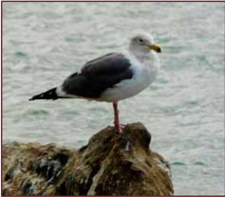
Western Gull at Morro Bay

One of the best ways to see the birds of Morro Bay is from the water. There are many outfitters who rent kayaks, canoes and electric boats. Ospreys are often seen perching on top of boat masts in the harbor.