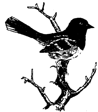
San Francisco Spotted Towhee Pipilo maculatus falcifer Birds of Golden Gate Park Joseph Mailliard • 1930

Archipelago will introduce us to many songbirds, parrots, woodpeckers, hornbills, cuckoos, and the Monkey-eating Eagle. Many of these birds are threatened with extinction due to loss of habitat and intensive hunting pressure. Moses will briefly discuss conservation efforts.