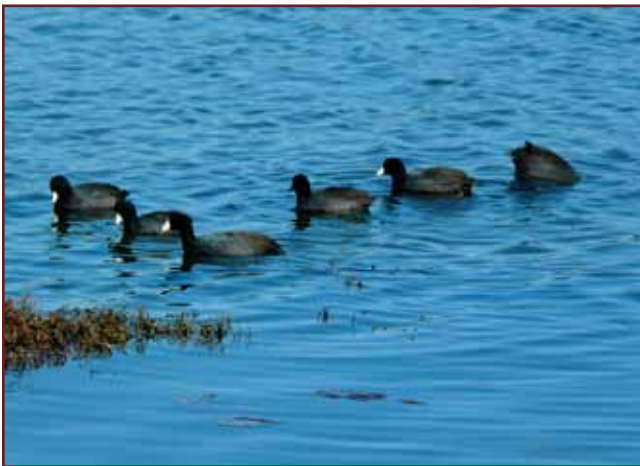
American Coots, Morro Bay. "There's always one . . ."

Non-Profit Org. U.S. Postage PAID Permit No. 66 Concord, CA