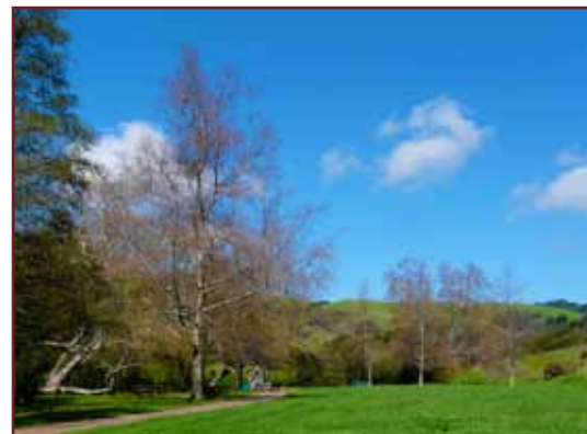
Garin Regional Park

Carpool leaves at 7:15 AM from Sycamore Valley Road Park and Ride. Meet in parking lot at the end of Garin Road at 8:00 AM. Take I-680 south and I-580 west. Take Castro Valley exit and continue west. Turn left onto Crow Canyon Road and go under the freeway. Crow Canyon Road becomes Grove Way and then A Street. At A Street and SR 238 (Foothill Blvd.), turn left. Foothill Blvd./SR 238 becomes Mission Blvd. Go south about 3 miles to Garin Road, turn left, and follow to its end. Spring migrants will be our goal.