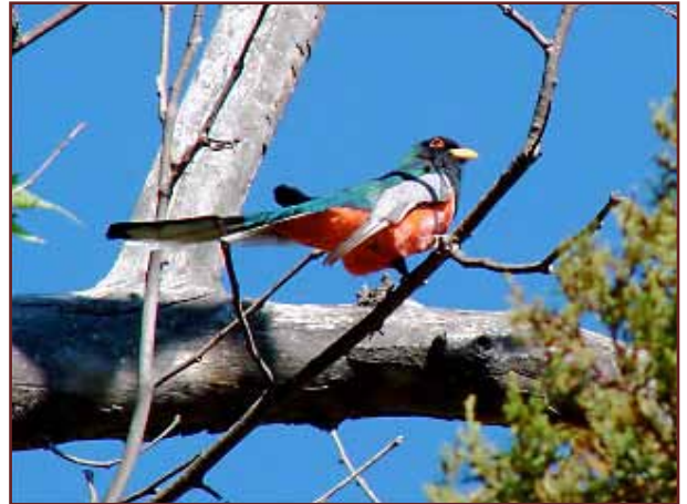
Elegant Trogon.

With 7,100 islands stretching from the Malaysian-Indonesian complex in the south to close to Taiwan in the north, and sandwiched between the South China Sea and Pacific Ocean, the Philippines is a rewarding