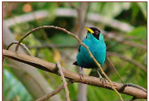
Green Honeycreeper.

and challenging place to watch birds. The processes of geology and evolution have left one of the highest degrees of endemism known in the world, with some 200 species of birds found only within the Philippine archipelago. The tropical island habitats, forested lowlands and mountain ranges, along with areas of swamp and marshlands and its long coastline are favorable to a rich and diverse birdlife.