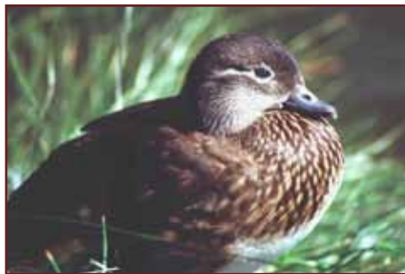
Wood Duck nesting box on San Ramon Creek in downtown Walnut Creek. Female Wood Duck.

with enough Wood Duck boxes to install 12 boxes in San Ramon Creek from Macy's, downtown Walnut Creek, to Creekside Drive. Then install four more boxes in lower Tice Creek and four on Tice Creek in Rossmoor. Three boxes were installed at Heather Farm Park because so many people who visit the park enjoy seeing Wood Ducks in the lake and canal. So the project is all about nesting cavities for Wood Ducks to breed in our creeks so people can enjoy watching them! If you enjoy projects like this, a membership to Mt. Diablo Audubon helps support more projects.