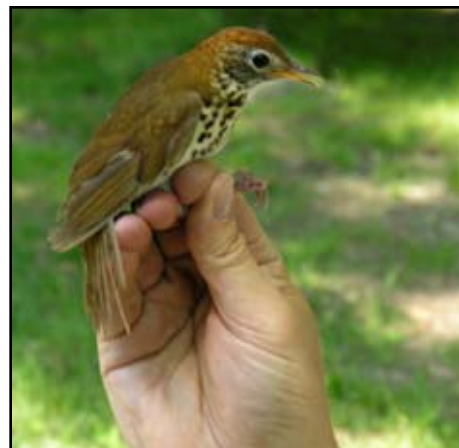
Wood Thrush at Muscatatuck NWR

We continued our drive with other stops at nature centers in Indiana and Ohio, then reboarded Amtrak towards home.