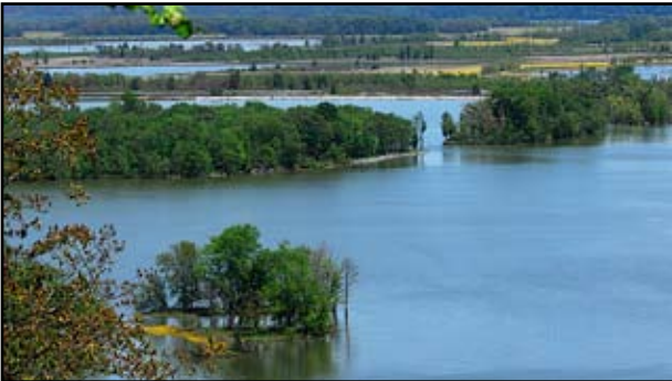
Duck River Bottoms at Tennessee NWR

Non-Profit Org. U.S. Postage PAID Permit No. 66 Concord, CA