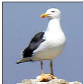
After breeding in the Gulf of California, Yellow-footed Gulls regularly travel north to the Salton Sea where they are sought after by avid birders.