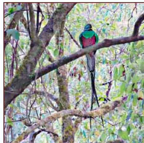
Resplendent Quetzal.

On our way back to the Bougainvillea Hotel where