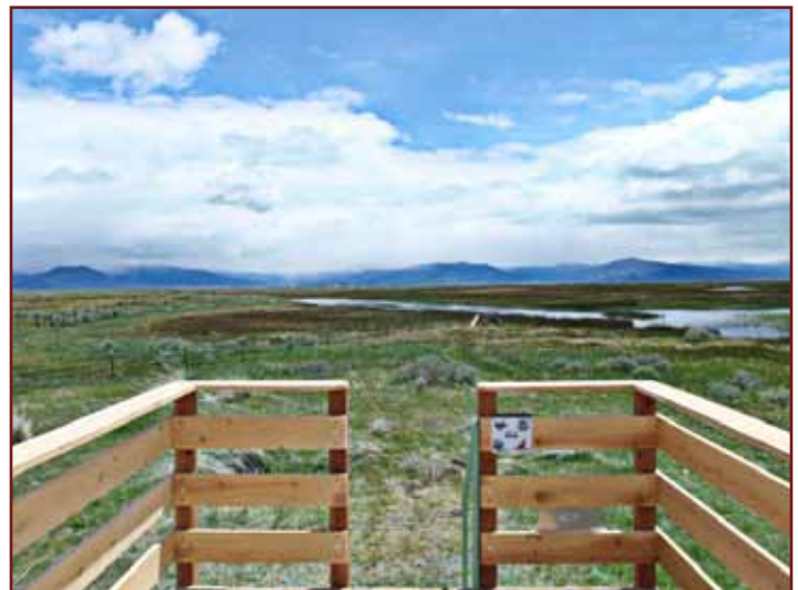
View from the new wildlife viewing platform, Maddelena Ranch, Sierra Valley. Note the plaque acknowledging the sponsorship of MDAS.

Carpool location: Sun Valley —Southwest corner of the Sun Valley Mall parking lot at Willow Pass Road and Contra Costa Boulevard in Concord.