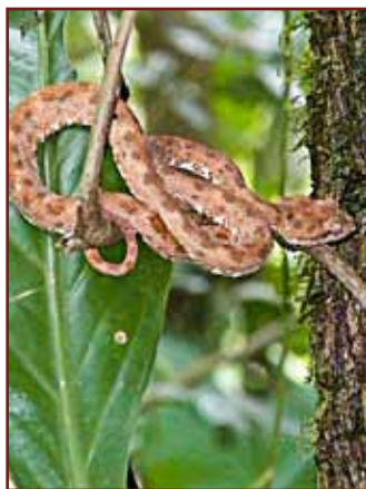
Eyelash Pit Viper at Arenal Hanging Bridges.

Seeing the birds was our primary objective, but we also saw monkeys, sloths, Eyelash Pit Viper, two types of iguana, basilisk whiptails, crocodiles, caimans, anteaters, coatis and agoutis. We