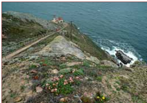
Point Reyes. Lighthouse

Carpool leaves Sun Valley at 7:00 AM. Meet 8:30 AM at Bear Valley Visitor Center in Olema. From I-80 in Vallejo, follow SR 37 19.1 miles to Atherton Avenue, exit and turn left, cross US 101 to San Marin Drive and continue for 3 miles. Turn right on Novato Blvd for 6 miles to stop sign, then turn left on Point Reyes-Petaluma Road for 7 miles to another stop sign. Go straight on Platform Bridge Road to Sir Francis Drake Boulevard. Turn right to Olema. Turn right at stop sign and take SR 1 north for 0.25 miles, then turn left on Bear Valley Road. Visitor Center is off Bear Valley. We are hoping for migrants. Bring lunch and liquids. Weather is unpredictable.