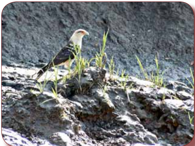
Yellow-headed Caracara along the banks of the Río Grande de Tárcoles, Costa Rica.

Non-Profit Org. U.S. Postage PAID Permit No. 66 Concord, CA