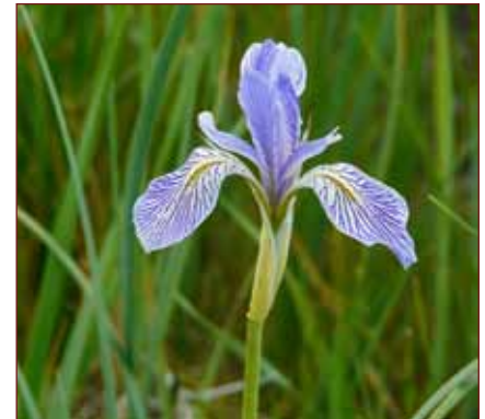
Mountain Meadow Iris Maddelena Ranch, Feather River Land Trust Sierra Valley

Saturday morning. Make motel reservations now! Closest motels are in Sierra City, 11 miles down Highway 49 to the west. Herrington's Sierra Pines (530-862-1151 or 800-682-9848) is one of the most popular; or try Yuba River Inn (530-862-1122) with cabins and kitchenettes (cash or check only). Bassett's Station (530-862-1297) at Highway 49 and Gold Lake Road has some accommodations and meals. Also, in Calpine is Sierra Valley Lodge (530-994-3367 or 800-858-0322). More listings are at www.sierracity.com/Stay/LodgingCamp.html Campgrounds are located at Yuba Pass and Chapman Creek downhill to the west. Sites are available first come/first serve for only three days at a time. Longer term reservations can be made at 877-444-6777, but there is an additional $10 charge for this service. After June 13 call Wild Birds Unlimited (925-798-0303) for information.