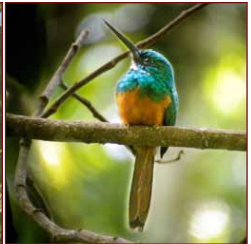
Left: Great Green Macaw. Right: Rufous-tailed Jacamars are insect eaters and nest in burrows along stream sides like kingfishers.

lowed by a siesta. The afternoon included 3 or 4 hours of birding. Dinner was followed by compiling the daily bird list. By 9 or 10 PM most birders were more than ready for a good night's sleep.