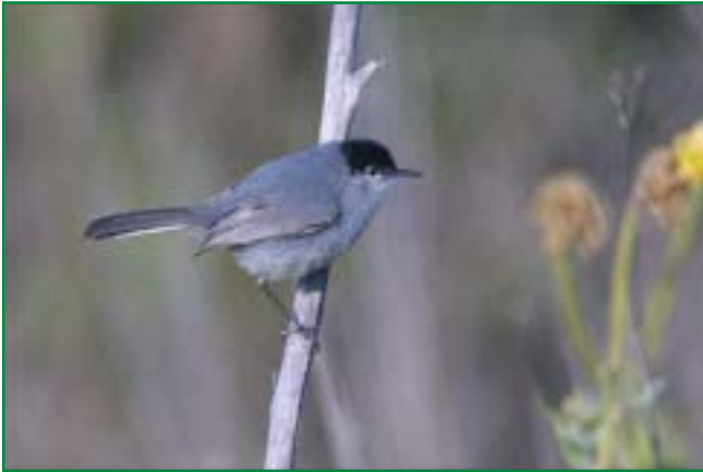
California Gnatcatcher • Polioptila californica