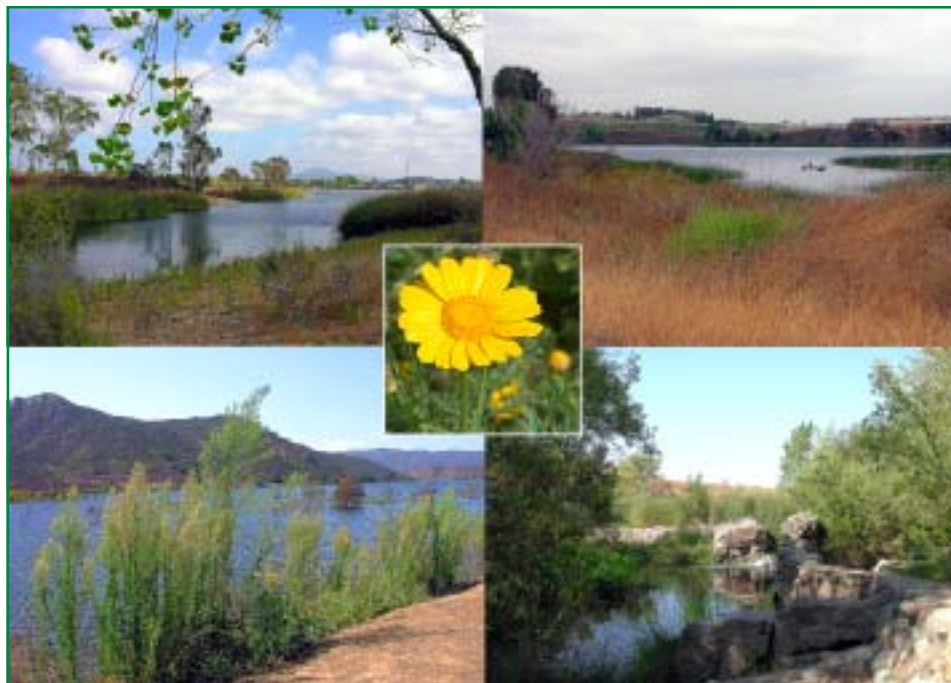
Five locations in San Diego County where California Gnatcatchers may be found. Clockwise from upper left: Lake Murray, Lower Otay Lake, Old Mission Dam at Mission Trails Regional Park, Lake Hodges. Inset, sea dahlia at San Elijo Lagoon.