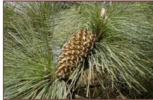
Coulter pine cone, Black Diamond Mines.

the evergreen leaves, and the prominent sandstone outcroppings show their resplendent colors. The Chaparral Loop is also an excellent place to see foothill pine ( Pinus sabiniana ) and Coulter pine ( Pinus coulteri ) growing side by side. Gray-green needles of the foothill pine droop, contrasting with the straight, dark green needles of the Coulter pine. Mount