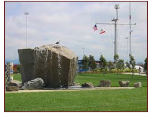
Middle Harbor Shoreline Park

Grizzly Island, February 7. Fifteen members and guests traveled to Grizzly Island Wildlife Sanctuary in the morning and finished with lunch at Rush Ranch. It was