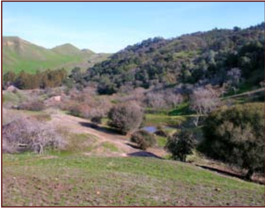
Somersville site viewed from Nortonville Trail

Non-Profit Org. U.S. Postage PAID Permit No. 66 Concord, CA