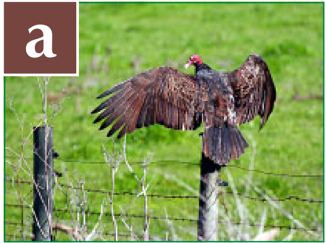
Turkey Vulture in Marin County.

Santa Cruz Island for the Island Scrub-Jay. June 5. Los Angeles Audubon Society. (323) 876-0202 (Tues.–Sat.); www.LAAudubon.org . Cost: $85. Leaves Island Packers dock in Oxnard