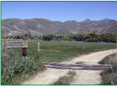
Audubon-California's Kern River Preserve