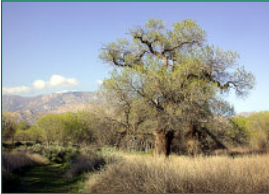
Fremont Cottonwood Nature trail at Audubon Kern River Preserve

Non-Profit Org. U.S. Postage PAID Permit No. 66 Concord, CA