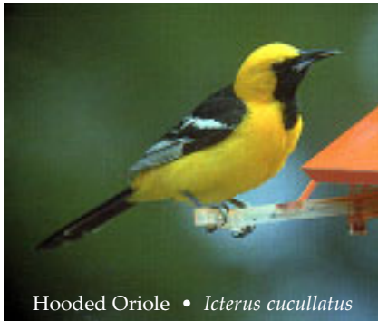
Hooded Oriole • Icterus cucullatus