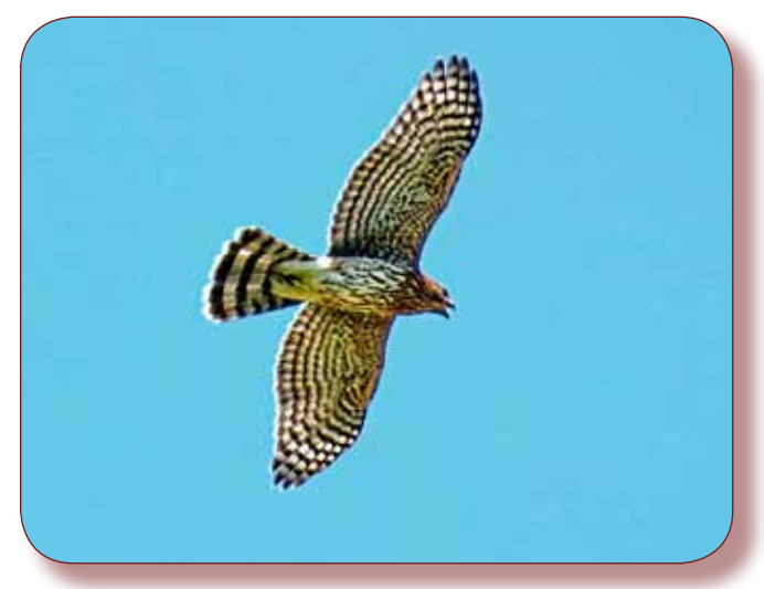
Cooper's Hawk.