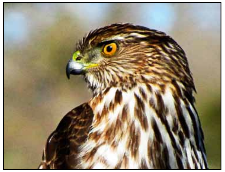
Cooper's Hawk.

The field identification of these two species presents a challenge to many birders, beginners and old hands alike. There is great variation in plumage and in size for the two; a female sharpie may be the size of a male Cooper's—the size of a dove. The female Cooper's is the size of an American Crow. No single field mark is likely to distinguish one species from the other. No field guide will substitute for plenty of practice in the field.