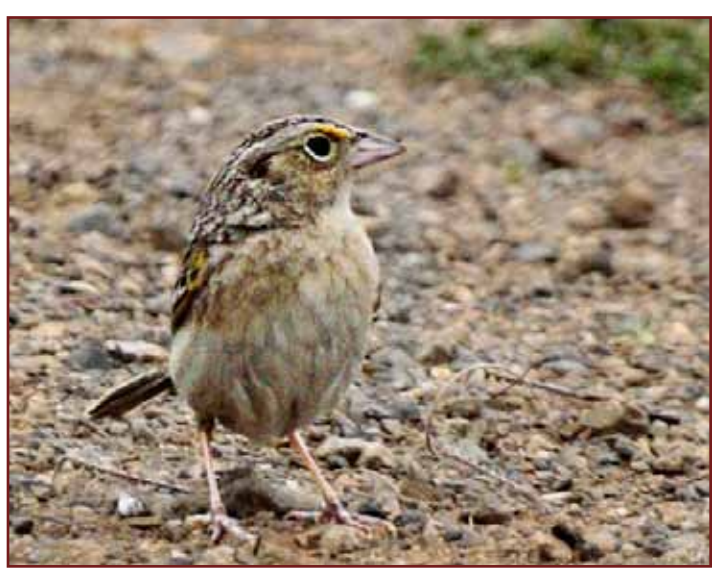
Grasshopper Sparrow.

Garin Regional Park, April 6. Garin Park in early April: A cool spring day, very green, with just an occasional touch of drizzle. Calling Pacific-slope Flycatchers, singing Song Sparrows, House Wrens, Bullock's Orioles, Orange-crowned and Wilson's Warblers. Nesting Western Bluebirds and Tree and Barn Swallows. Winter birds still around included Hermit Thrush, Golden-crowned Sparrow, and Yellow-rumped Warbler. As we munched our lunches we watched a Great Blue Heron on the lawn as it captured a good-sized rodent, arranged it in its beak just so, and swallowed it whole. Best bird: first we heard it, then we glimpsed it, then it flew down onto the path and posed for everybody—a Grasshopper Sparrow. The numbers: 8 birders, 53 species. Fred Safier