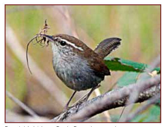
Bewick's Wren.

Hooded and Common Mergansers, a hunting Osprey and woodpeckers galore. Though the majority were Acorn Woodpeckers, we also saw Redshafted Flickers, a Red-breasted Sapsucker and heard a Nuttall's