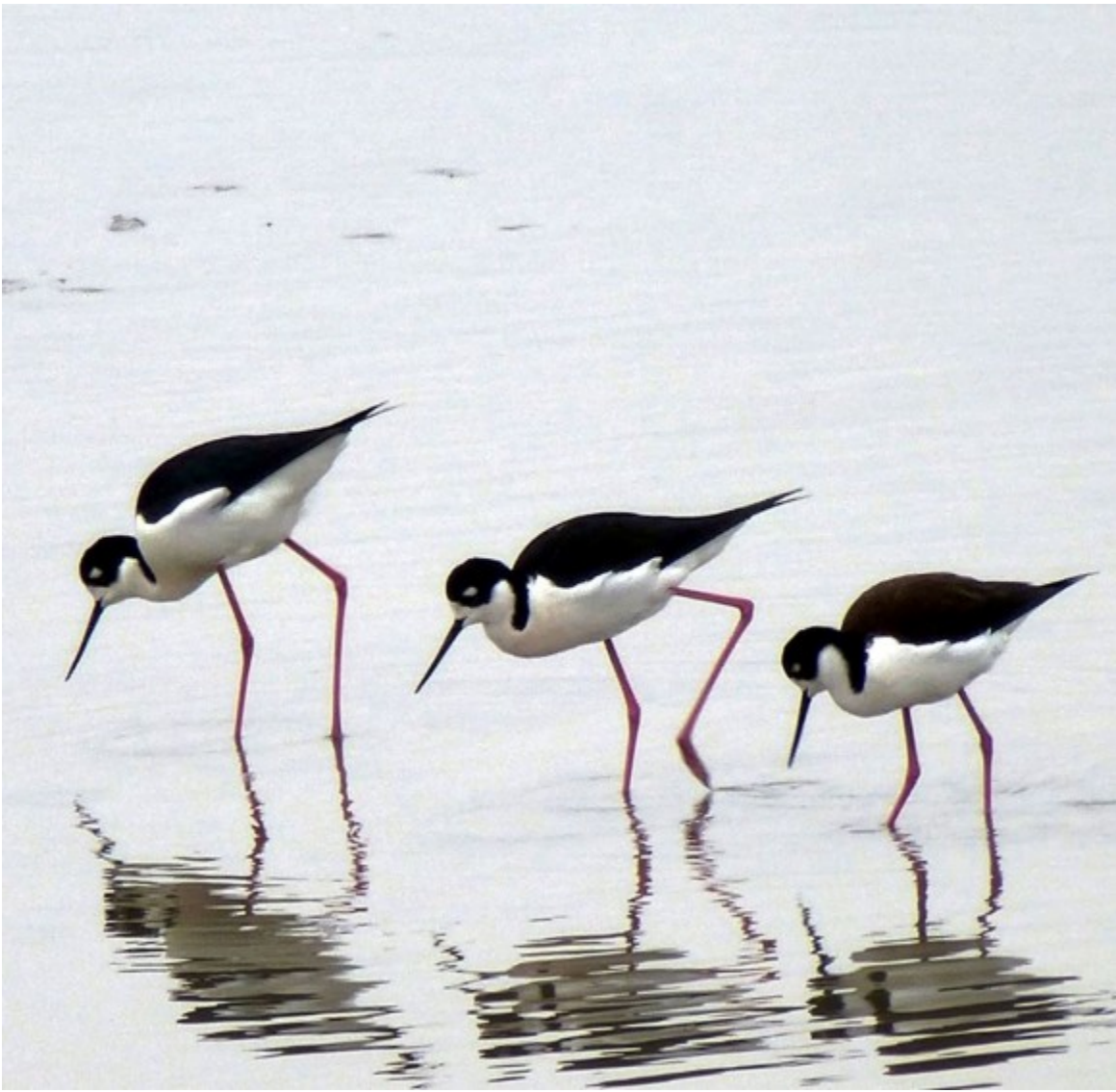
Species: Black-necked Stilts Location: Martinez Marina

"The balanced but syncopated composition make this one worthy of wall art!"