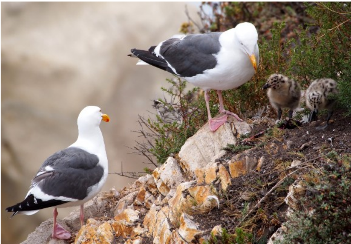
Species: Gull family Location: San Luis Obispo

"A breathtaking moment of perfect symmetry."