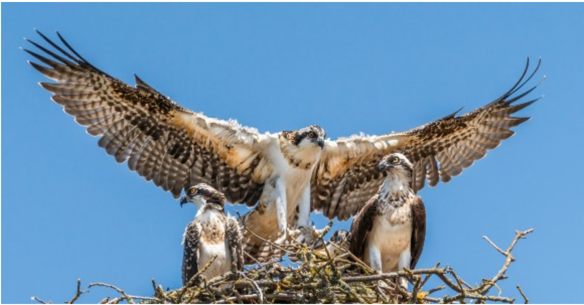
Species: Osprey family Location: Burson, California

"A breathtaking moment of perfect symmetry."