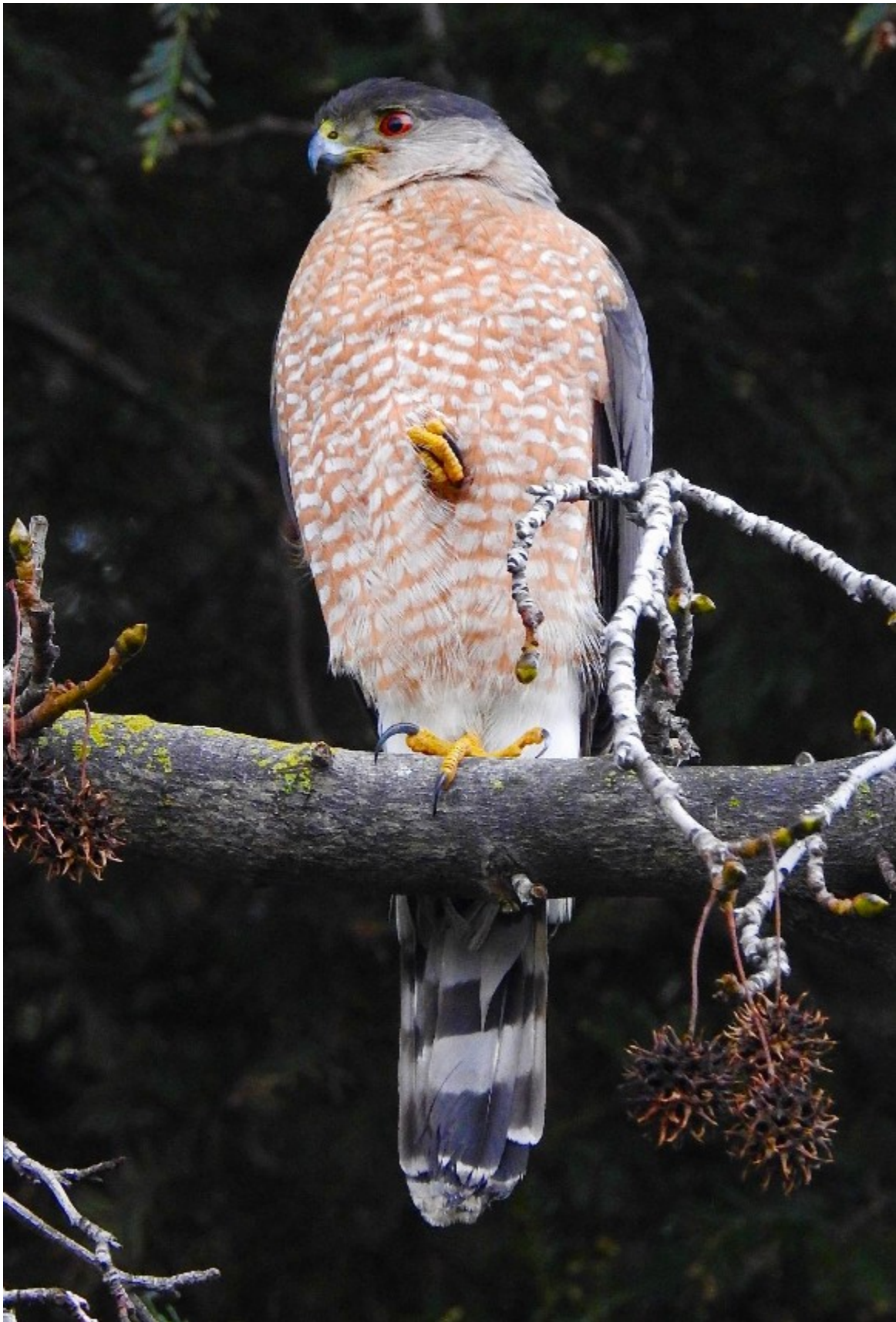
Species: Cooper's Hawk Location: Antioch

"That tiny foot held so daintily aloft cracks us up!"