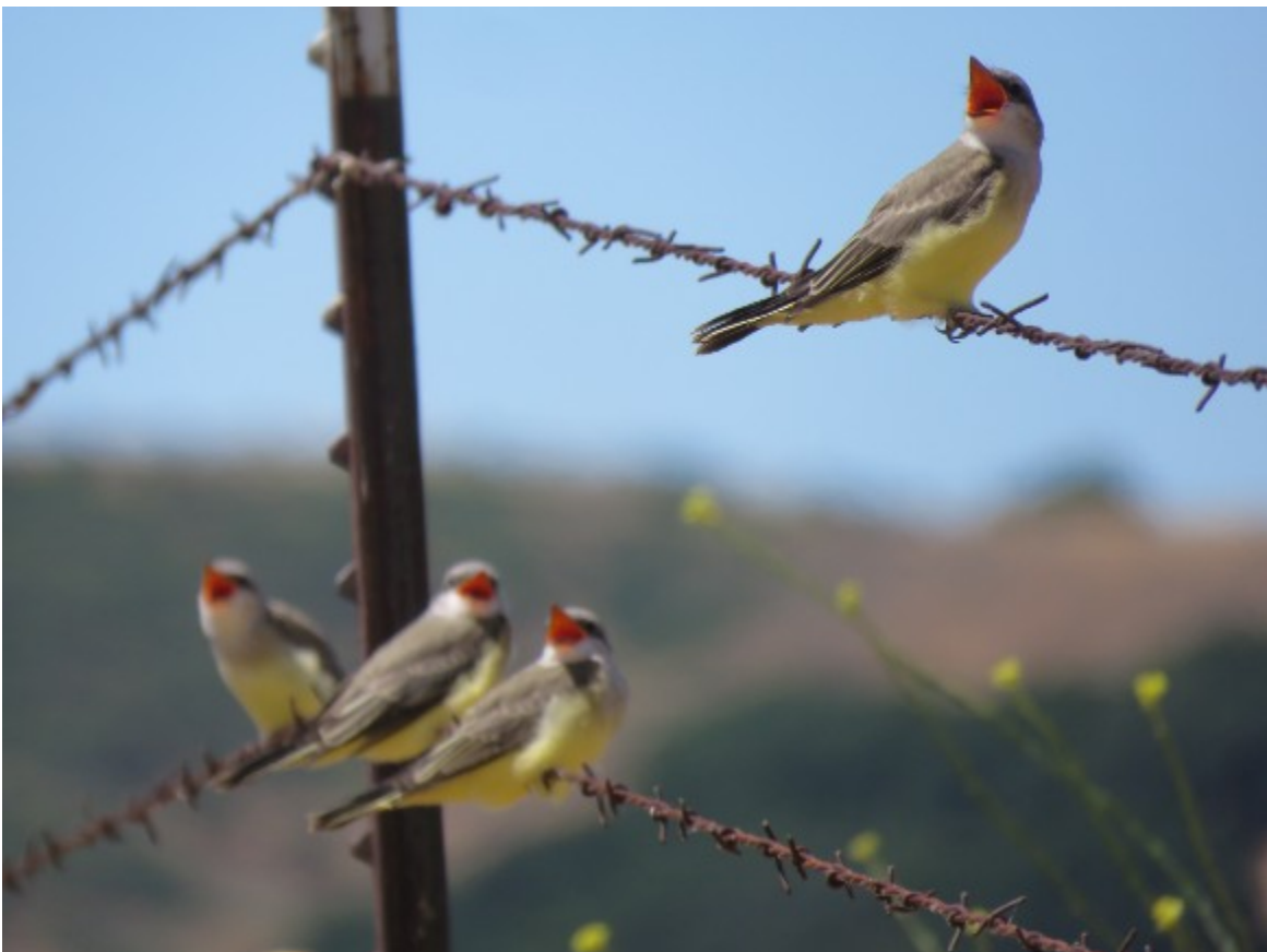
Species: Western Kingbirds Location: Martinez

"This picture is clear and it definitely tells a story! Points for innuendo."