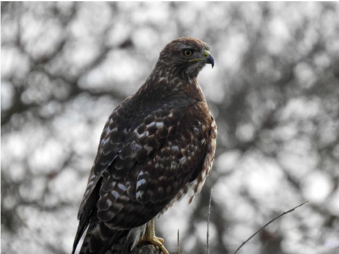
Species: Red-tailed Hawk

"What an attitude! No doubt who's boss here!"