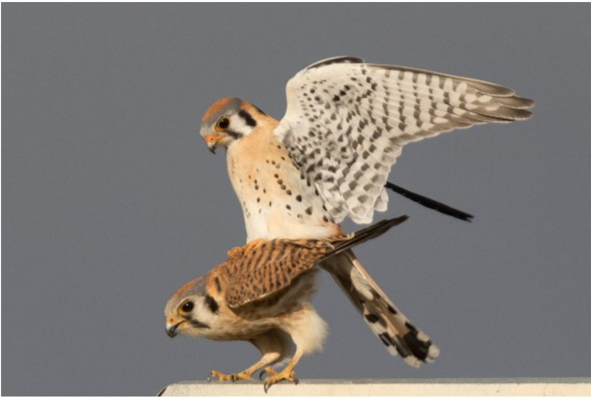
Species: American Kestrels Location: Danville

"This picture is clear and it definitely tells a story! Points for innuendo."