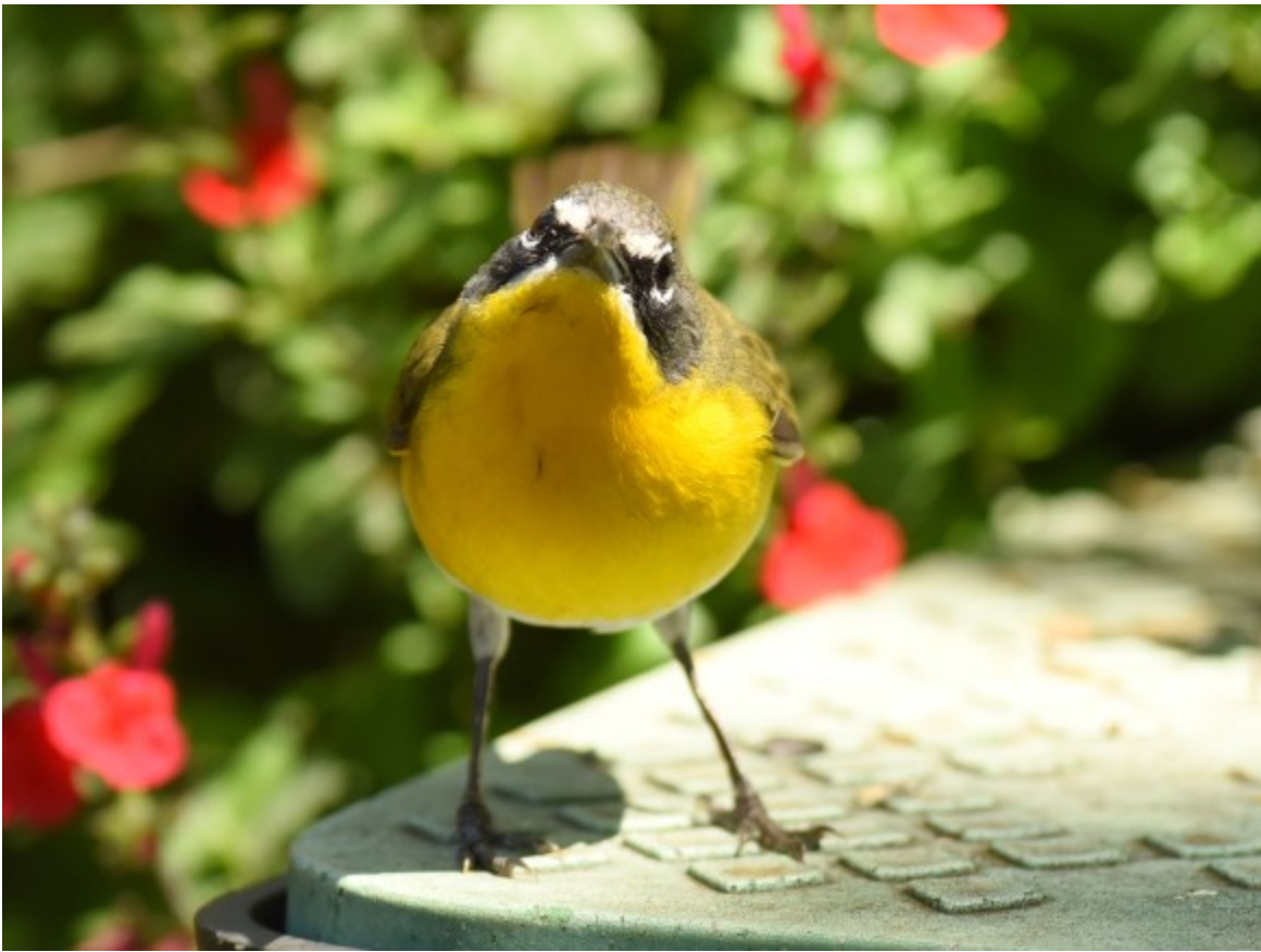
Species: Yellow-breasted Chat Location: Clayton

"What an attitude! No doubt who's boss here!"