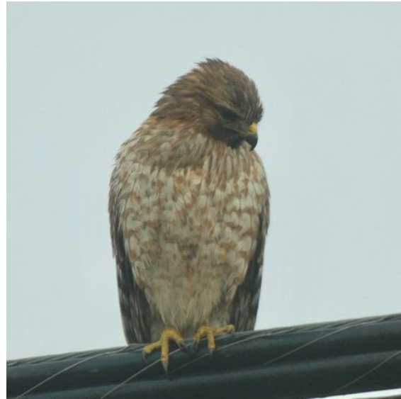
Juvenile Red-tailed Hawk