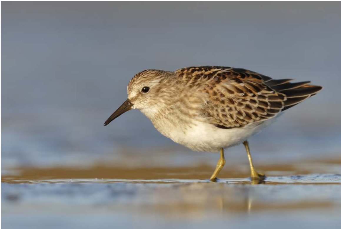
Least Sandpiper, Hayward Regional Shoreline