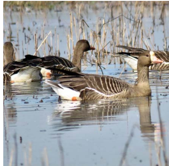
Greater White-fronted Geese

Top Photo: Snow Geese (near Cosumnes River Preserve)