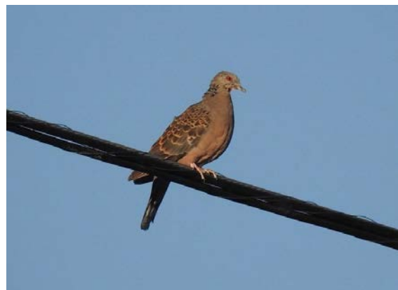
Oriental Turtle-Dove, Palo Alto, CA.