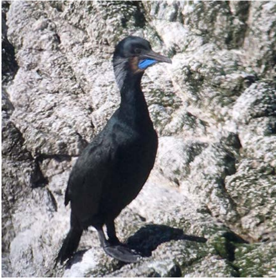
Adult Brandt's Cormorant

Head had the best birds of the day, including Surfbirds, Black Turnstones, Black Oystercatchers, three Cormorant species, and a Red-necked Grebe on the water.