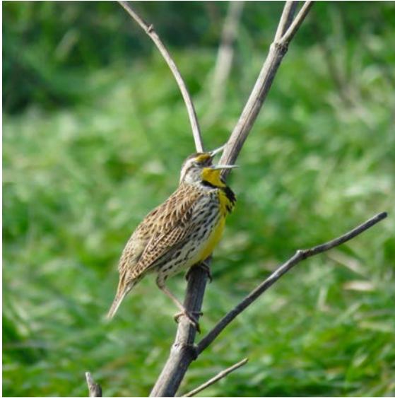
Western Meadowlark singing

this reduced our clarity. We were serenaded by a Western Meadowlark standing on a ground branch who almost continually sang. There were active Yellow-rumped Warblers in a tree. Suddenly a mixed flock of Snow Geese and Greater White-fronted Geese which had been resting on the other side of the road flew directly over us. Chick then led us down the road, and near the end, close to the road, on the north side, were Sandhill Cranes standing in the water.