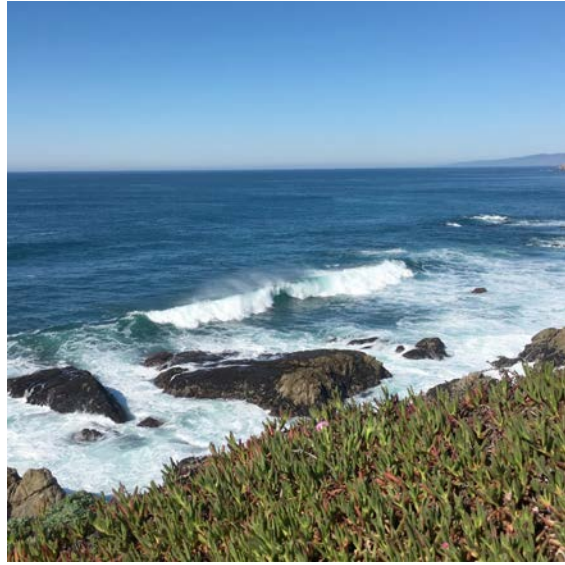
View from Bodega Head