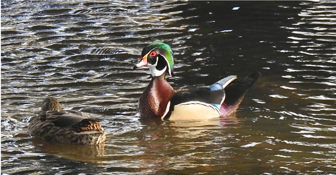
Wood Duck male with female Mallard on Grayson Creek