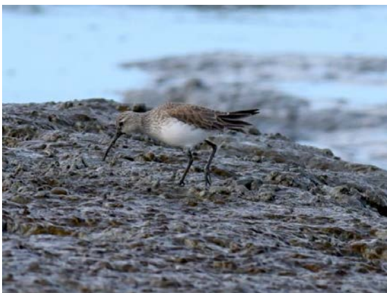
Curlew Sandpiper, Palo Alto Baylands.

As always, stay safe and get out there for the Birds!