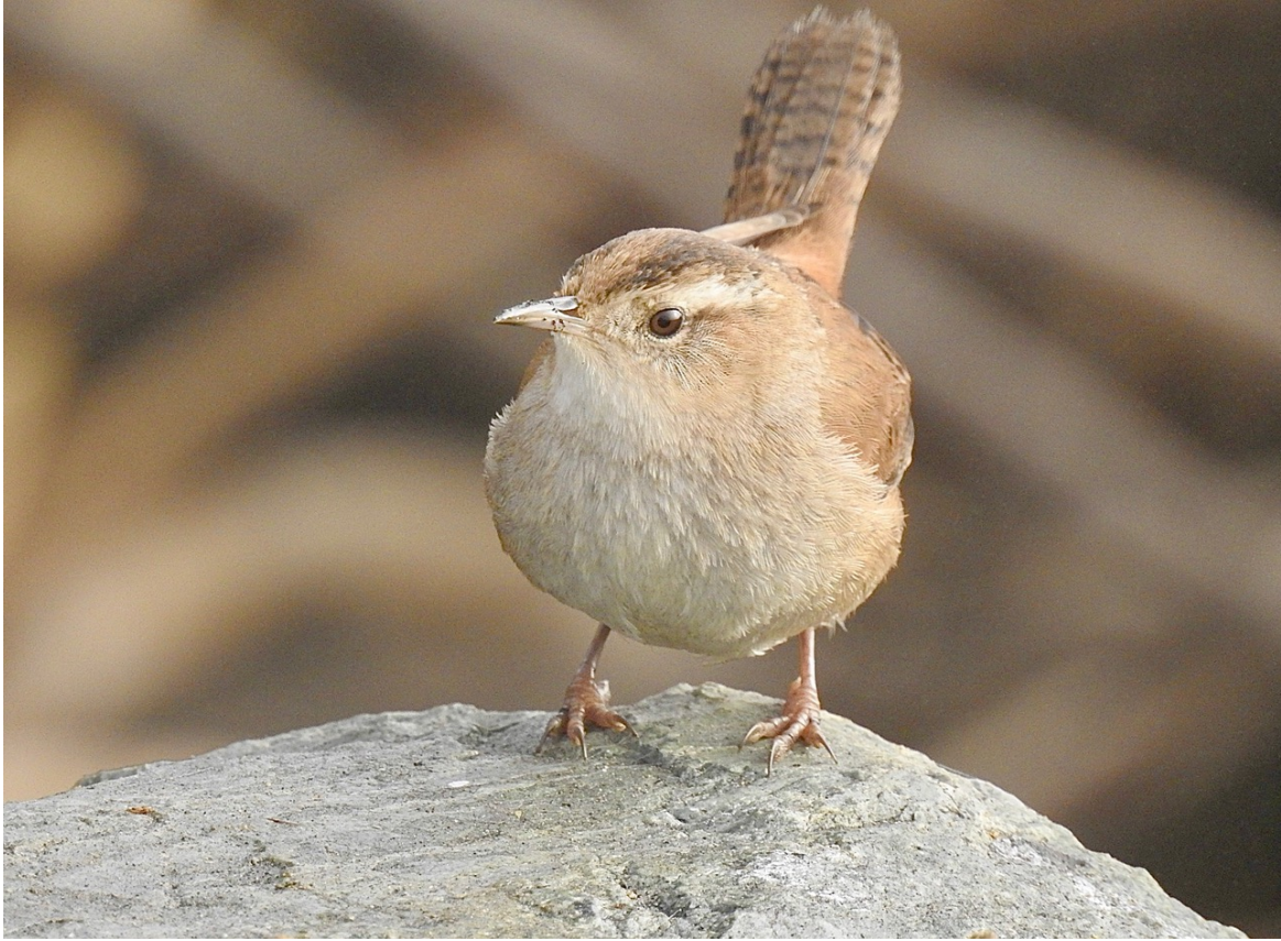
Marsh Wren at the Antioch Marina