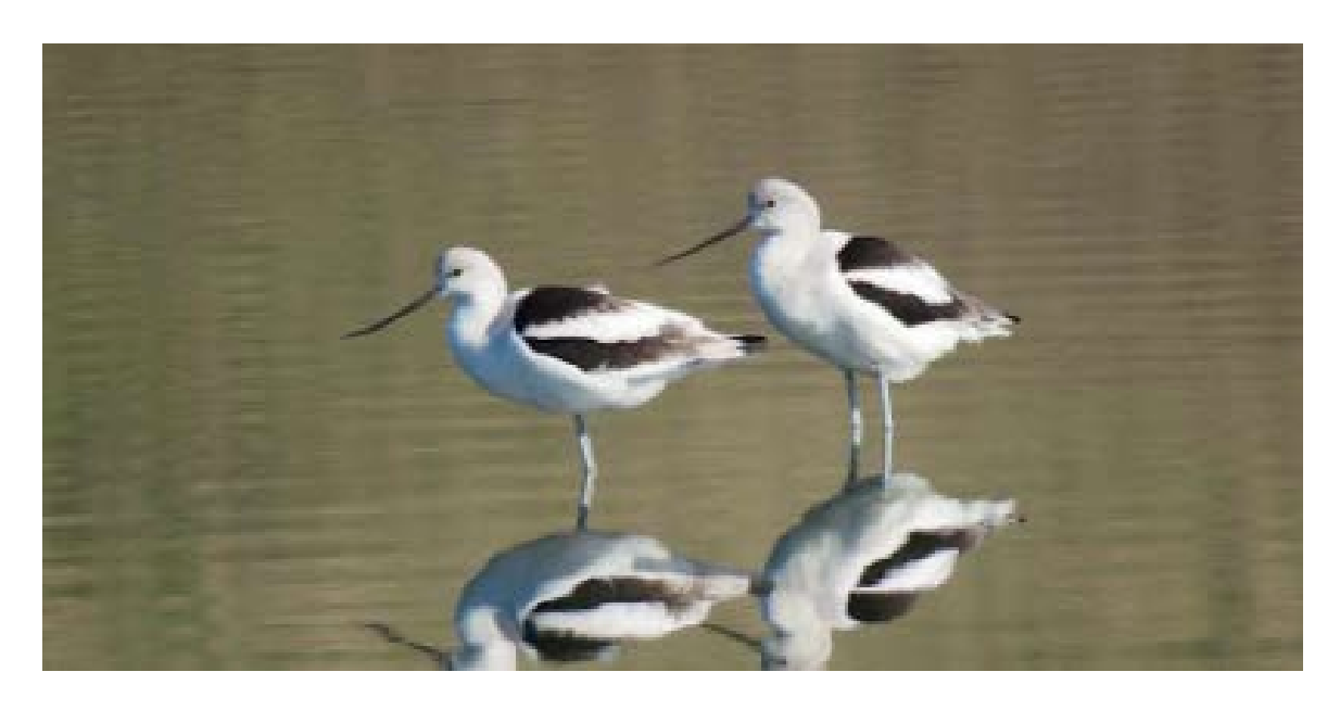
American Avocets

We see a variety of birds on the water on this trip that is only about a 55 minute drive from Walnut Creek. It is exciting to be on the largest tract of undisturbed marshland remaining in the San Francisco Bay. Locations include Charleston Slough, Shoreline Lake, Palo Alto Baylands, and Redwood Shores.