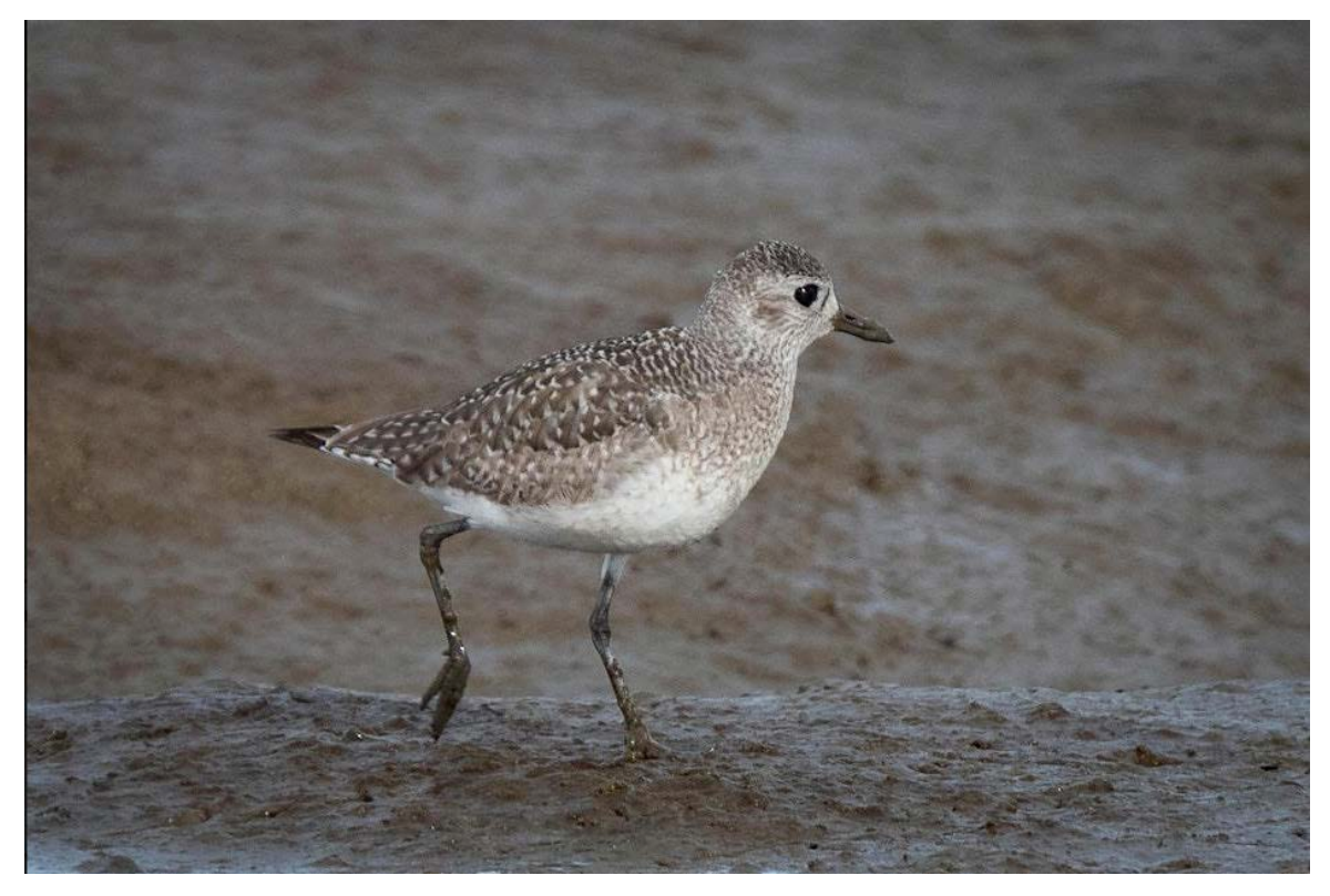
Black Bellied Plover

Meeker Slough is a wetland area in Richmond, on the coast of San Francisco Bay. We'll look for shorebirds, ducks, herons, and coastal passerines during the incoming tide. The walk is mostly on a paved and level trail. If time permits, we will also drive a few miles to check out Vincent Park and the Richmond Marina (Inner Harbor Basin). Please bring a spotting scope if you own one, I will bring two scopes if someone can carry one of them. I have a few loaner binoculars I can bring---if contacted ahead of time.