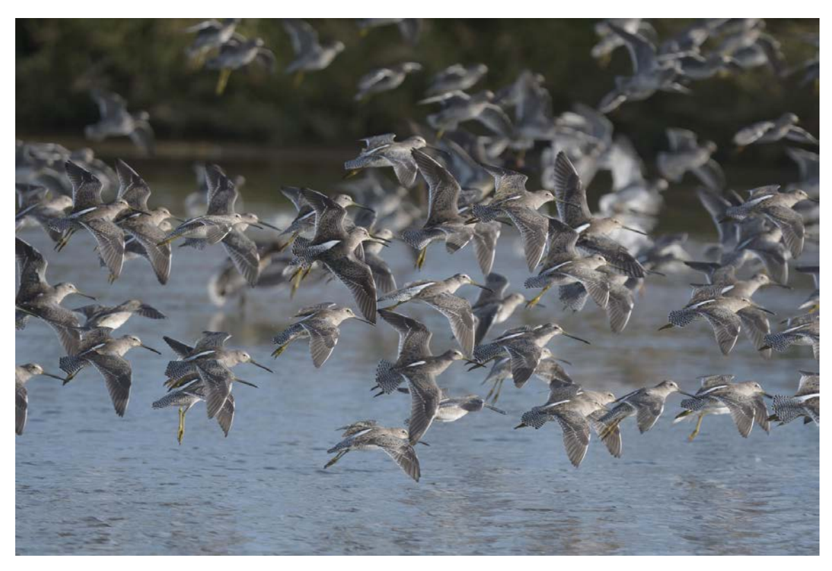
Long-billed Dowitchers

In winter McNabney Marsh, aka Waterbird Regional Preserve, hosts many species of ducks, shorebirds and waterbirds. Marsh passerines and raptors might also be present.