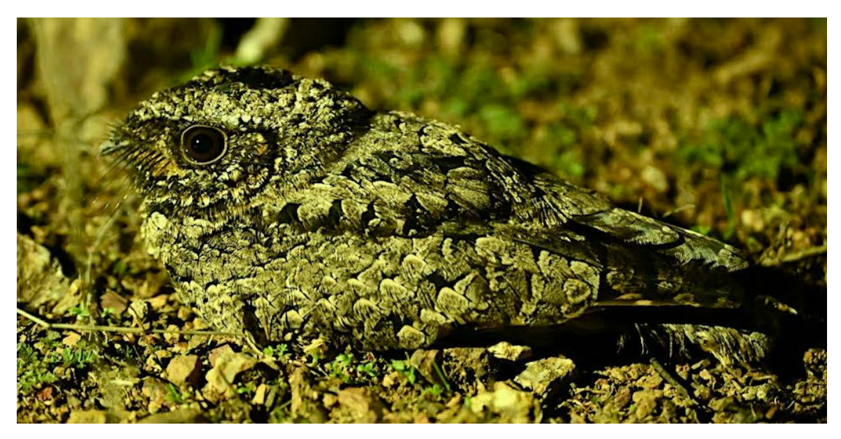
Common Poorwill

Hike up a fire road on the east face of North Peak in Mount Diablo State Park, to see Common Poorwills as they forage for moths along the fire roads through the chaparral. They will be detected by their eyeshine from our lights.