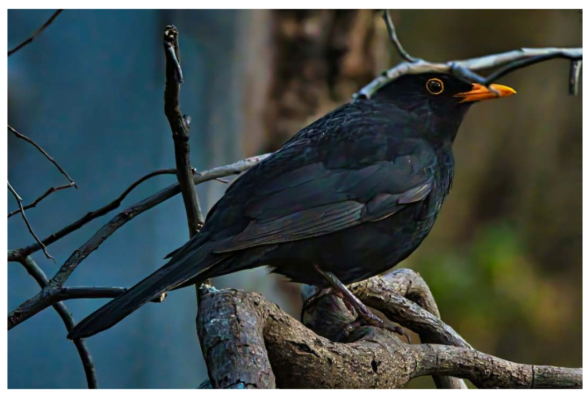
Study Reveals Bird-Migration Mystery