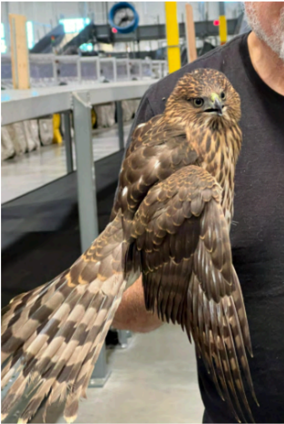
Juvenile Cooper's Hawk