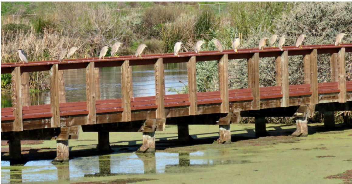
Black-crowned Night Herons