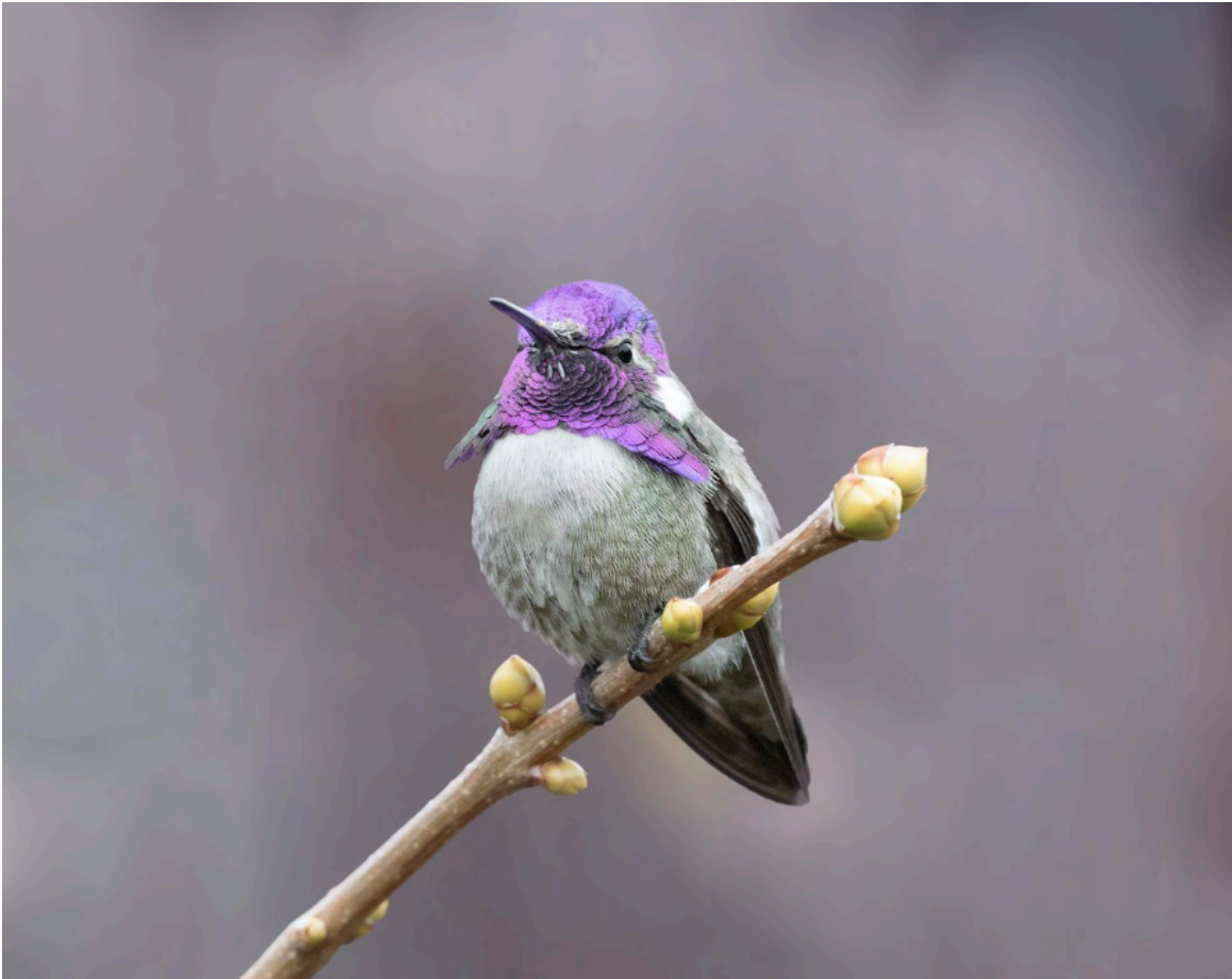
Costa's Hummingbird/ Tuolumne, California, United States