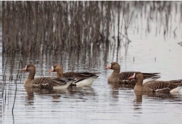
Greater white-fronted Geese