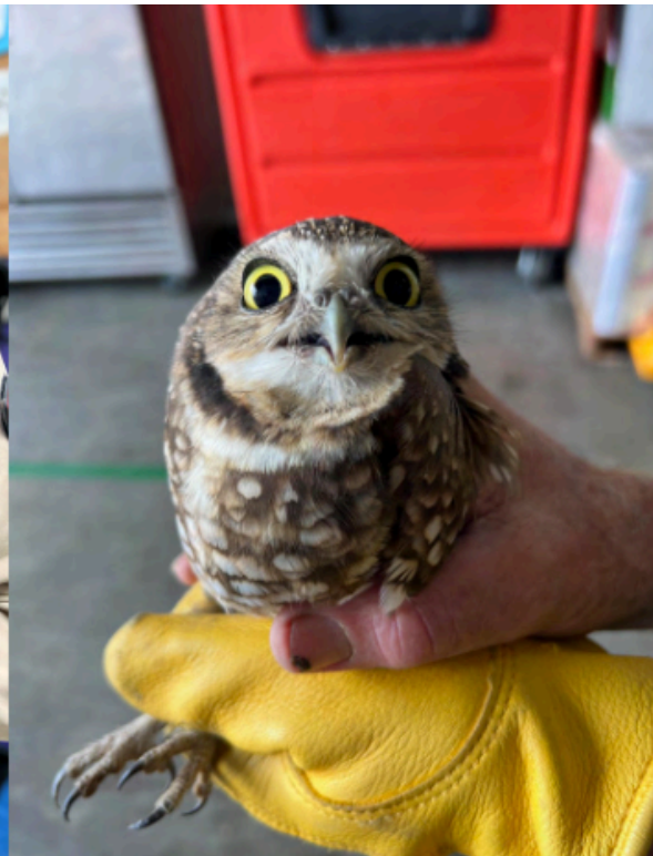
Migrant Burrowing Owl