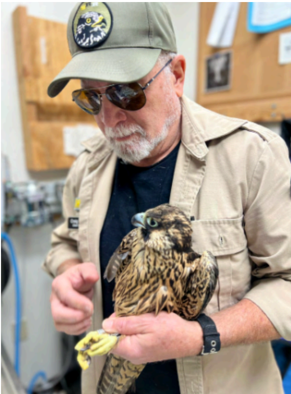
Juvenile Peregrine Falcon