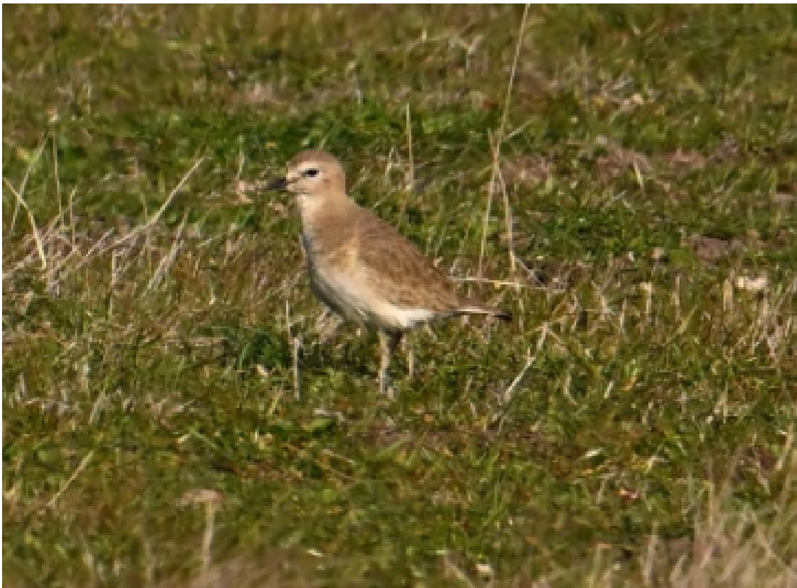
Mountain Plover, Solano County

All the best, and get out there for the birds!