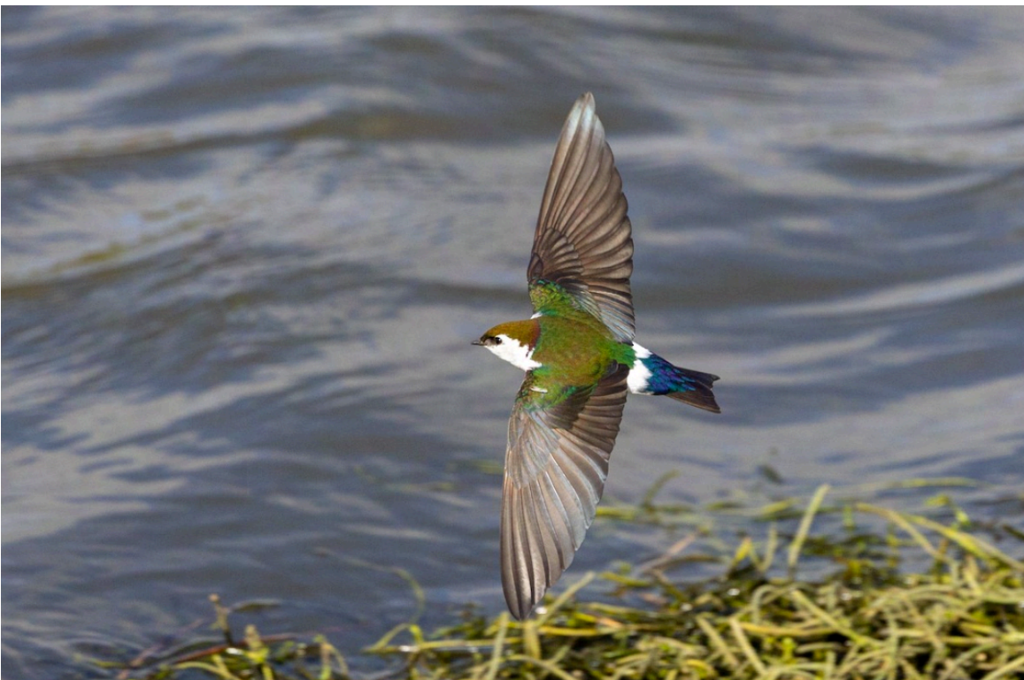
Violet-green Swallow / San Joaquin Marsh & Wildlife Sanctuary, Irvine, California,

Photo: Sherry Pratt / Macaulay Library ML 630569634